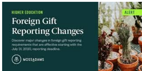
Higher Education Act Sec-117 Foreign Revenue Reporting