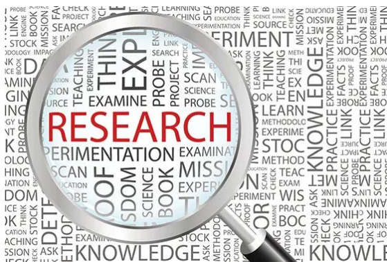
Changes to NIH Biosketch and Other Support Document Requirements