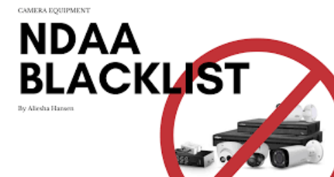
Covered Communications Certifications and Assurances