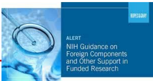
Clarification of Guidelines for what Constitutes a Foreign Grant Component

Visa applications and renewals denied, foreign nationals stranded.