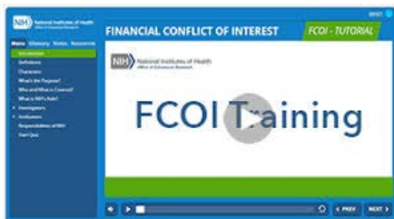
Reporting Foreign Financial Conflicts of Interest

What is Undue Foreign Influence? How does it manifest? How do we codify it? How do we mitigate risk?